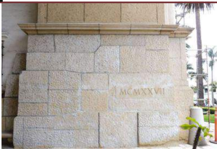
Before and after surface treatment on the Great Arch