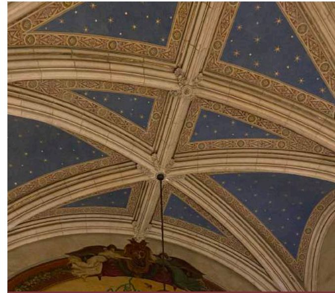
Law Library ceiling