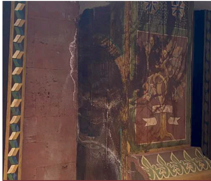
Water damage on painted surfaces