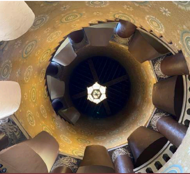
The Rotunda taken from the first floor

the staggering preservation and restoration requirements of a Landmark structure (over and above general maintenance and upkeep requirements) would not be possible.